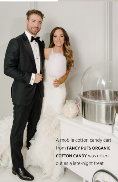
A mobile cotton candy cart from FANCY PUFFS ORGANIC COTTON CANDY was rolled out as a late-night treat.