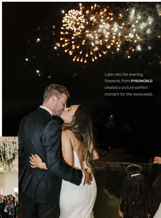
Later into the evening, fireworks from PYROWORLD created a picture-perfect moment for the newlyweds.