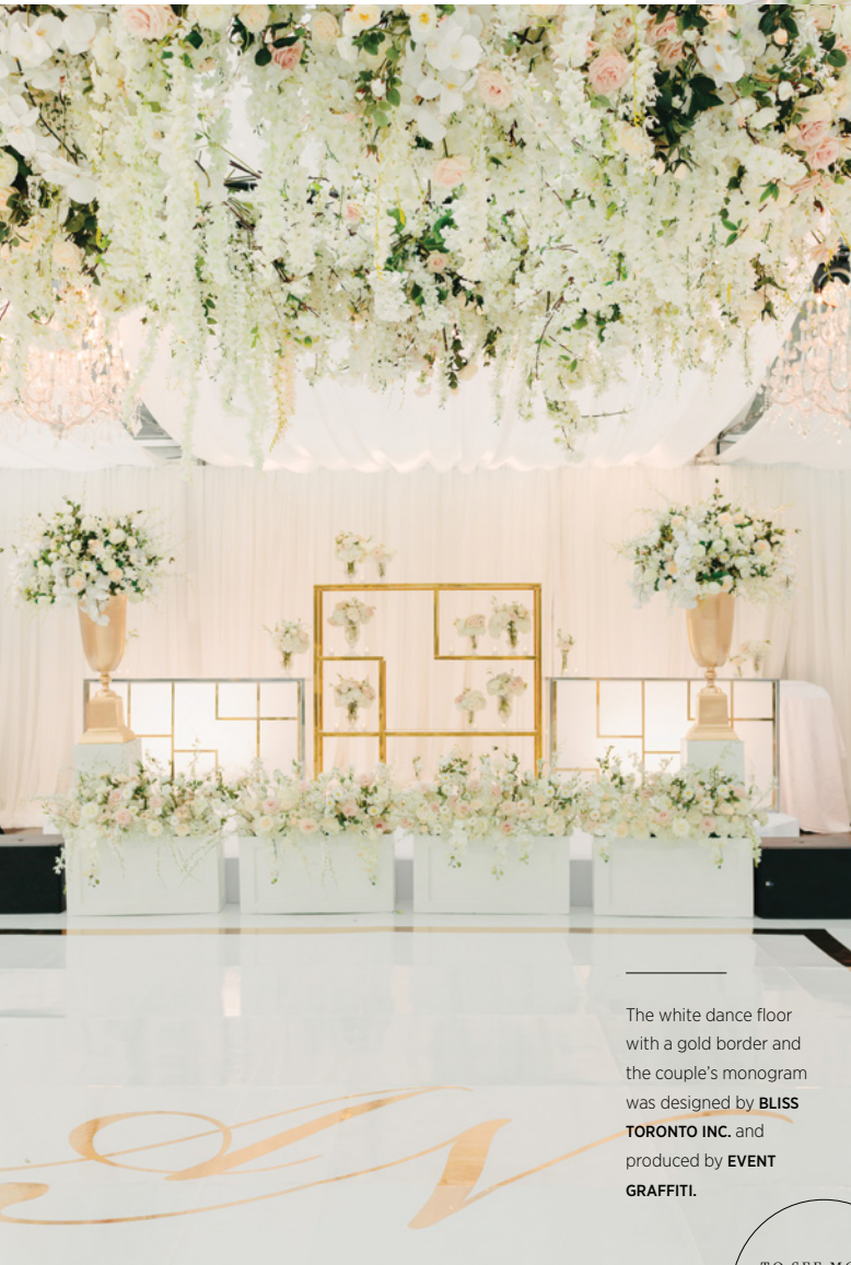
The white dance floor with a gold border and the couple’s monogram was designed by BLISS TORONTO INC. and produced by EVENT GRAFFITI .