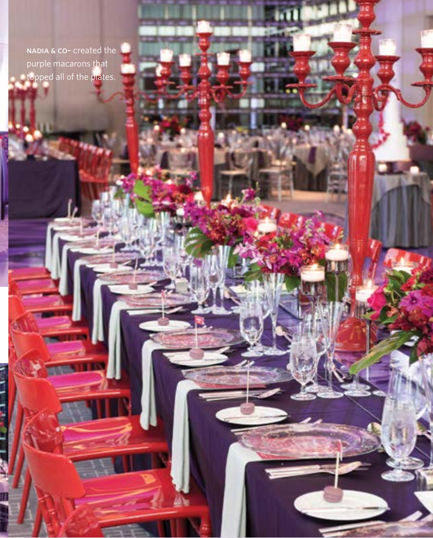
NADIA & CO- created the purple macarons that topped all of the plates.