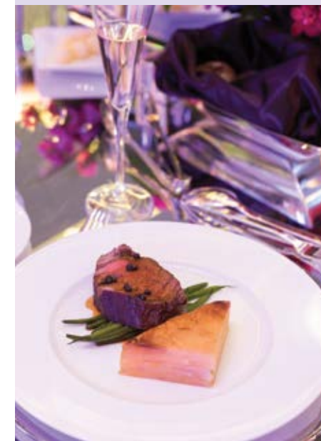
The FOUR SEASONS HOTEL TORONTO catered the wedding dinner with a menu that featured both Indian and Chinese dishes, with a touch of Canadian-inspired cuisine.

Gallery dining tables featured low floral centerpieces in mirrored rectangular vessels, all from Rachel A. Clingen Wedding & Event Design. Round tables were accented with tall, full arrangements and paired with transparent Grace chairs from DETAILZ COUTURE EVENT RENTALS. Red candelabras completed the vibrant tablescapes and complemented the acrylic, red Pierre chairs from CONTEMPORARY FURNITURE RENTALS INC. Throughout the space, blooms in deep reds and purples were dispersed for further electric pops of colour. "The visual sensation was unforgettable," shares Charlotte.