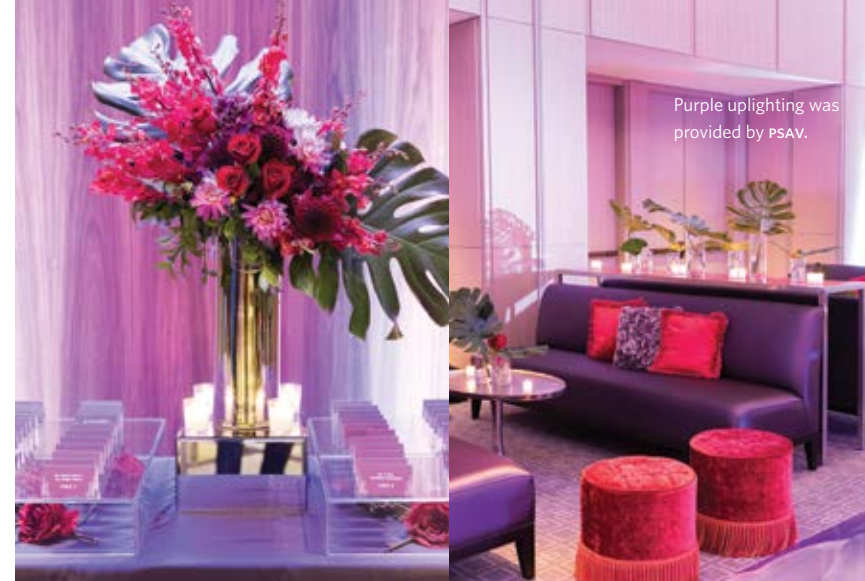
Purple uplighting was provided by PSAV.