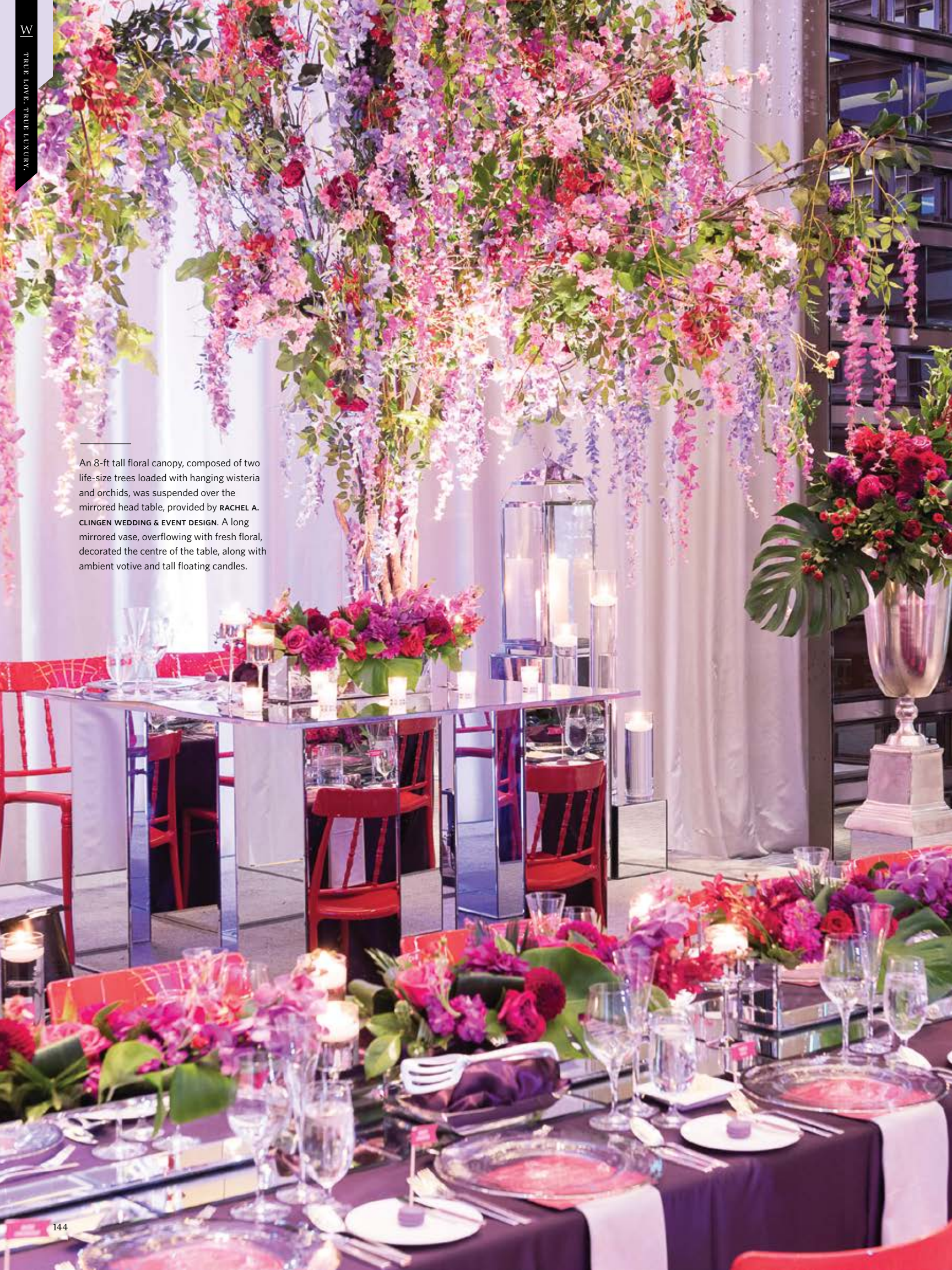
An 8-ft tall floral canopy, composed of two life-size trees loaded with hanging wisteria and orchids, was suspended over the mirrored head table, provided by RACHEL A. CLINGEN WEDDING & EVENT DESIGN. A long mirrored vase, overflowing with fresh floral, decorated the centre of the table, along with ambient votive and tall floating candles.