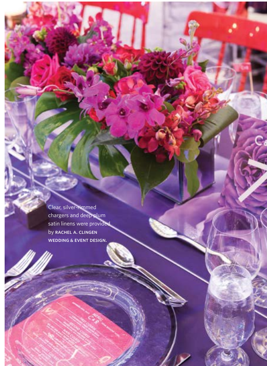
Clear, silver-rimmed chargers and deep plum satin linens were provided by RACHEL A. CLINGEN WEDDING & EVENT DESIGN.